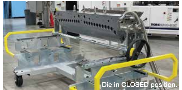
Die in CLOSED position.

Available in three basic configurations for single, double or triple-manifold dies, a unique width adjustment design accommodates a variety of die geometries ranging from 1000 to 2000mm (39-79") widths using adjustable trunnion supports making this one of the most versatile die splitting systems on the market.