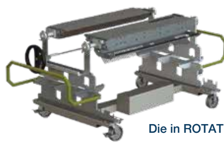
Die in ROTATED position.